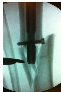
Figure 6: Case 2 – Periprosthetic fracture below the arthrodesis nail after a second MVA.

Kuchinad et al. [6] reported a series of bone lengthening using ring fixation with secondary nailing as a salvage procedure after failed TKA. He recommended a cement coated rod to avoid pin track infection. Furthermore a ten day period between frame removal and intramedullary nailing has been recommended [15] as a safety margin to prevent infection. However, temporary cast application is not possible after bifocal tibial and femoral bone elongation. In a further study “nailing after lengthening” did not increase the risk of infection [9]. In our cases thorough wound management was applied, including antibiotics, antibiotic cement spacers and antibiotic beads. Arthrodesis nail breakage or periprosthetic fractures [16] are most uncommon [17,18]. However, these complications need meticulous treatment either by implantation of a longer nail [7] or even plating [19], depending on the location of fracture and the treated bone. Hinarejos et al. [18] reported periprosthetic fractures above and below a modular knee arthrodesis nail. In one of our cases periprosthetic fracture occurred and was finally treated with a longer arthrodesis nail.