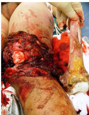
Figure 4: Case 2 – Clinical state at the emergency room with a 26 cm bone defect.