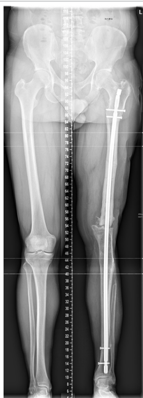
Figure 3: Case 1 – X-ray a.p. views 20 years after initial trauma, knee arthrodesis nail after refracture and infection treatment.

In our cases we saw as major complication docking site problems, which were treated successfully by bone grafting. In case 1 docking site problem appeared after secondary fracture and infection. In case 2 there was a delayed consolidation after the NAL procedure. However, comparative studies between open, closed or endoscopic docking procedures did not show any difference in bony healing [12,13]. Biz et al. [14] presented a case series of non unions and re-fractures at the consolidated docking site, treated by intramedullary nailing, achieving union and complete bone healing [14].