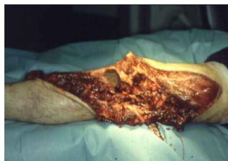
Figure 1: Case 1 - Extensive soft tissue defect on the lower limb with a totally destroyed knee joint after a motorcycle accident.

These cases demonstrate successful use of knee arthrodesis nails even in severe trauma cases as a limb salvage procedure. However, these