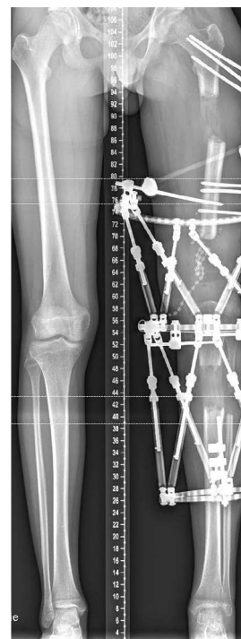
Figure 5: Case 2 – X-ray a.p. views using ring fixation for bifocal callus distraction.