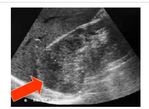
Figure 1: Abdominal Eco-Right Kidney Tumor.

After pregnancy and right nephrectomy the evolution of the patient was favorable with normalization the value of blood pressure