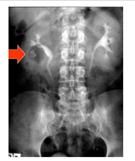
Figure 3: UIV-Right Kidney Tumoral Syndrome-Lacunar Image.