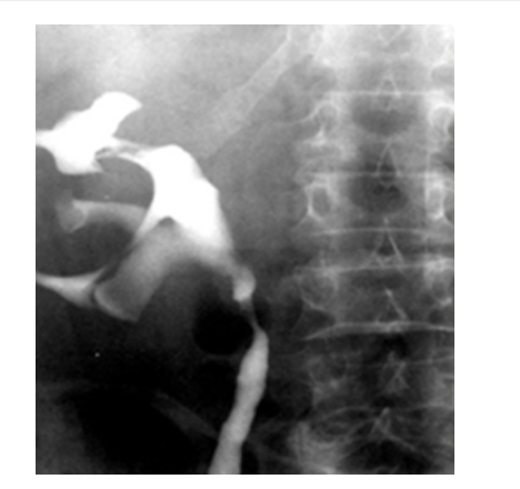
Figure 4: UIV-View Image Lacunar Image Right Kidney.

without drugs. The patient refused to follow protocol of therapy with radiotherapy and chimiotherapy.