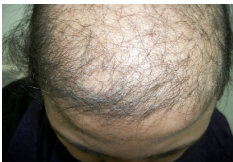
Figure 1: Partial loss in the scalp hair in the girl.

A nine year old male and his sister five years old who born from a first-degree consanguineous marriage visited our outpatient department with complaints of rough skin over the scalp and over the body since five years for the boy and two year for the girl in association with total loss of scalp and eyebrow hair in the boy and partial loss in the girl. At birth, their parents noted the absence of scalp and eyebrow hair, which gradually, over the next three to four years grew to some measure and eventually became scanty (Figure 1).