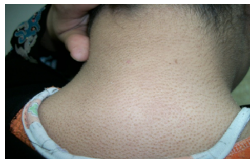
Figure 3: Multiple follicular flesh-colored horny papules in neck.

*Corresponding author: Khaled Gharib, Department of Dermatology, Zagazig University, Egypt, Tel: 44519-57487; E-mail: kh_gharib@hotmail.com