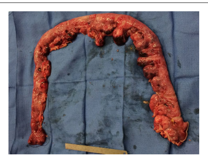
Figure 1: Surgical evaluation demonstrates large diverticula, predominantly along the antimesenteric border of the small bowel.