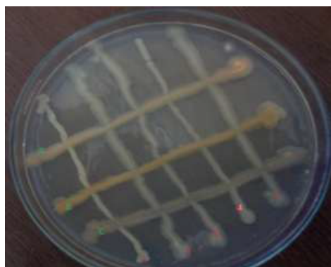
Figure 3: Cross streak assay against chicken associated pathogens 1 and 4: Vibrio sp. 2: Streptococci sp., 3 and 5: Yersinia sp. A-C are THB strain isolates.