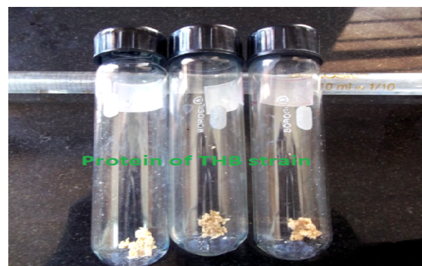
Figure 2: Isolated protein of THB strain.

For MIC determination 0.5 ml of various concentration of extracts