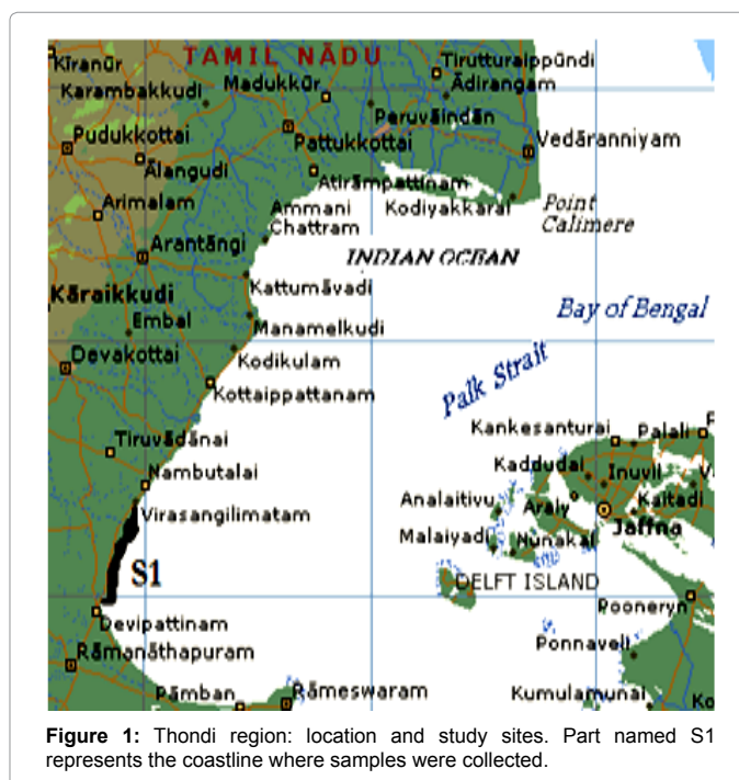
Figure 1: Thondi region: location and study sites. Part named S1 represents the coastline where samples were collected.

Amphiroa anceps species of Sea weeds were collected during