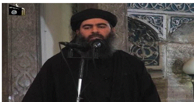
Figure 2: ISIS Chief Abu Bakr Al-Baghdari, the self-declared Caliph of the Islamic World.