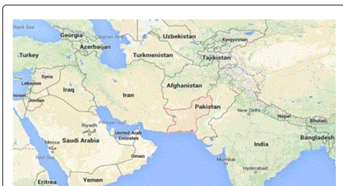
Figure 5: The map shows Baluchistan, the largest province of Pakistan which is said to be one of the centres of activities of ISIS.