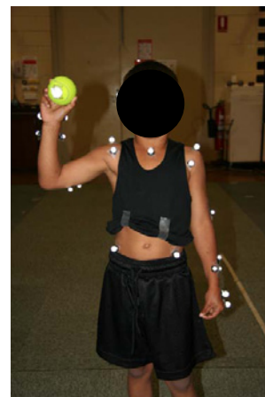
Figure 1: Reflective marker set used for calculation of joint kinematics.

Upon arrival participants had standard anthropometric measures of height and mass recorded. Children were asked if they played on organized teams in sports using overhand throwing (cricket, softball or tee ball). None reported playing on organized teams. Following three warm-up trials each participant completed a minimum of three maximal effort overhand throws at a large indoor goal (2.14 m high \times 3.66 m wide) located 5 m in front of the release position. This procedure was completed for both dominant and non-dominate throwing arms. Participants were instructed to throw the tennis ball as hard as possible (e.g., with maximum velocity) with no further instructions or coaching provided. Visual observation suggested that participants did throw with maximal effort. Motion capture data of the participant and ball were recorded at 250 Hz with a 12 camera Vicon motion analysis system (Oxford Metrics Inc., UK). A customized University of Western Australia biomechanical model and marker set were used (based on the design of [18]). The marker set consisted of 38 retro reflective markers, 10 mm in diameter, fixed to the children's skin by adhesive double sided