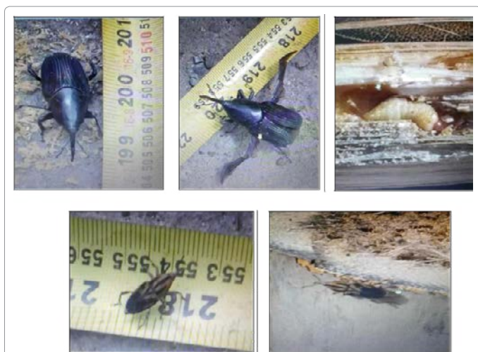
Figure 4: Finding coleoptera in the cellulose and trunk of the palms.

Since then, environmental authorities together with different entities are committed to its conservation with a project built on the basis of effort and dedication. But the struggle is not only to preserve the parrot but its 'home', that is why a study of the population dynamics of the Chuapo palm has been done since 2015, and in a recent phase the measurement of the rates of Mortality and growth in each. This impinges on the importance of analyzing the environmental services offered by the Socratea as a wildlife refuge.