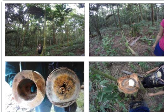
Figure 1: Material cut in the municipality of Restrepo, Meta, Orinoquía, Colombia. For the accomplishment of laboratory tests, wood of the plucking.

During the field work performed for the elaboration of the necessary cuts for laboratory tests, the presence of different Coleoptera