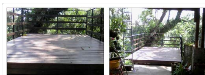
Figure 3: Wood of chonta, used in the construction of deck as experimental prototype, designed and constructed by the architect Francisco Quiñonez.

Figure 4 was found, which may be present in the specimens, possibly due to the existing symbiotic activity.