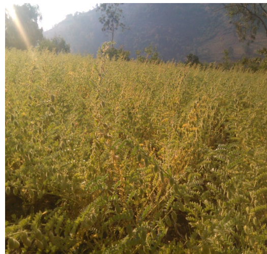
Figure 1: Chickpea PVS evaluation field at Konta special woreda.

Chickpea, a multi-functional crop, has an important role in the diet of the Ethiopian small scale farmers' households and also serves as protein source for the rural poor who cannot afford to buy animal products [3-6]. Besides, due to its ability to withstand drought stress, smallholder farmers in Ethiopia grow chickpea at the end of the main rainy season using residual soil moisture. This permits farmers to grow a second crop and secure an additional source of income and protein through efficient use of the residual moisture in black soils at the end of the rains. Chickpea is valued for its nutritive seeds with high protein content, 25-28% after dulling. There are two main types of chickpea, distinguished by seed size, shape and color. The first relatively small seeds is called desi and with large seed called Kabuli. As a nutritious legume crop, chickpea has the potential to improve both soil health and human nutrition. Performing well on residual moisture, chickpea also allows farmers to harvest two crops in a growing season (cereal followed by chickpea), boosting their food supply and income (Figure 1).