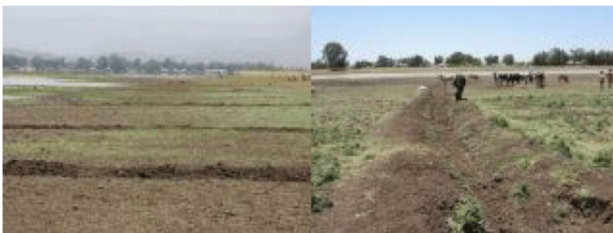
Figure 8: Furrows of Welala reservoir with 50 m intervals at both sides of farm lands to irrigate their crops.