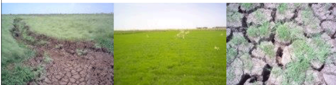
Figure 5: Lack of irrigable water that shows cracked soil and poor plant color of Eragrostis teff that might lead to wilt and death of a plant prior to ripe.

periods, there has been a lot of clues such as cracking of soil at early stage of Eragrostis teff and its color also indicates its future negative fate that might end up with non ripe seeds (Figure 5).