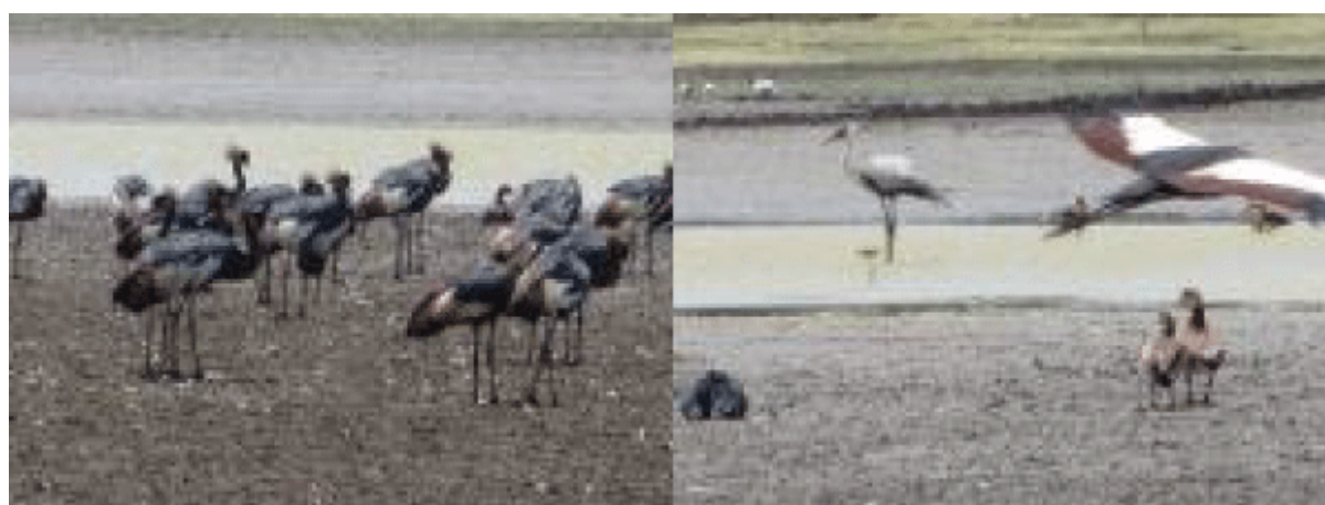
Figure 10: Ecotourism and fisheries are assumed to be an appropriate intervention in Welala wetlands of lake Tana.

Livestock production system in Welala wetland became totally dependent on leftovers and residues of crop production because during the rainy season cattle left the area due to high volume of flooding problem and during the dry seasons the area was shifted to crop cultivated land.