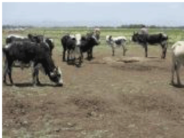
Figure 11: A paradox, cattle production system awaiting for watering from the well and supplemented feed stuffs from crop residues.

According to [8] a total of 274 benthic macro-invertebrate individuals belonging to 5 families were collected, 32,699 individual birds belonging to 62 species were enumerated and 13 species of macrophytes were identified. Based on qualitative assessment of the Present Ecological state of these two reservoirs modifications have reached at critical level which means less than 20% from its reference (Table 1).