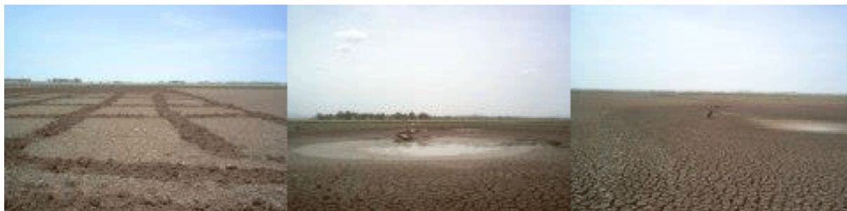
Figure 3: Total dried up of Shesher reservoir with shrieked mud aggregated by birds at the center.

drinking water even for their animals and themselves, they started digging well to fetch water from the Shesher reservoir.