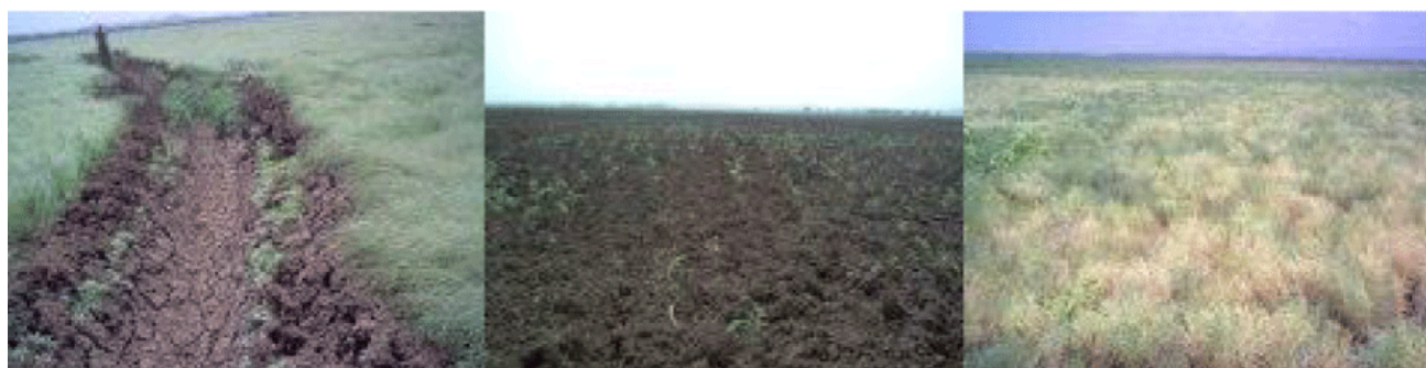
Figure 4: Major crops cultivated by draining water through furrow irrigation system from Shesher reservoir of Lake Tana wetland.

Un studied water use that is extensive use of irrigation to all directions of the reservoir causes shortage or even loss of whole available water which leads to wilt and dried of crop prior its ripening