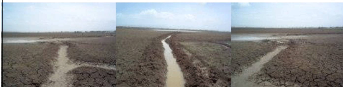
Figure 6: Uncontrolled drainage of Shesher reservoir for irrigation purpose until it totally dried up from the area.