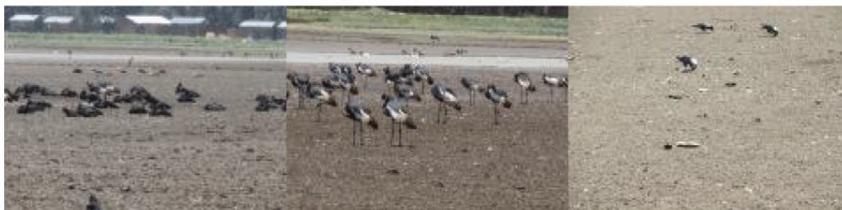
Figure 9: Highly populated birds and remnant dead fishes eaten by birds in the highly shrunked and almost dried Welala wetlands.

Especially fishes and birds are seriously affected during the pick dry seasons of the area and it is not uncommon to see remnant dead fishes eaten by birds (Figure 9). If Welala wetland could be protected from several imposed activities from the inhabitants it might be properly exploited by designing appropriate interventions for instance it can serve for fisheries and ecotourism activities (Figure 10).