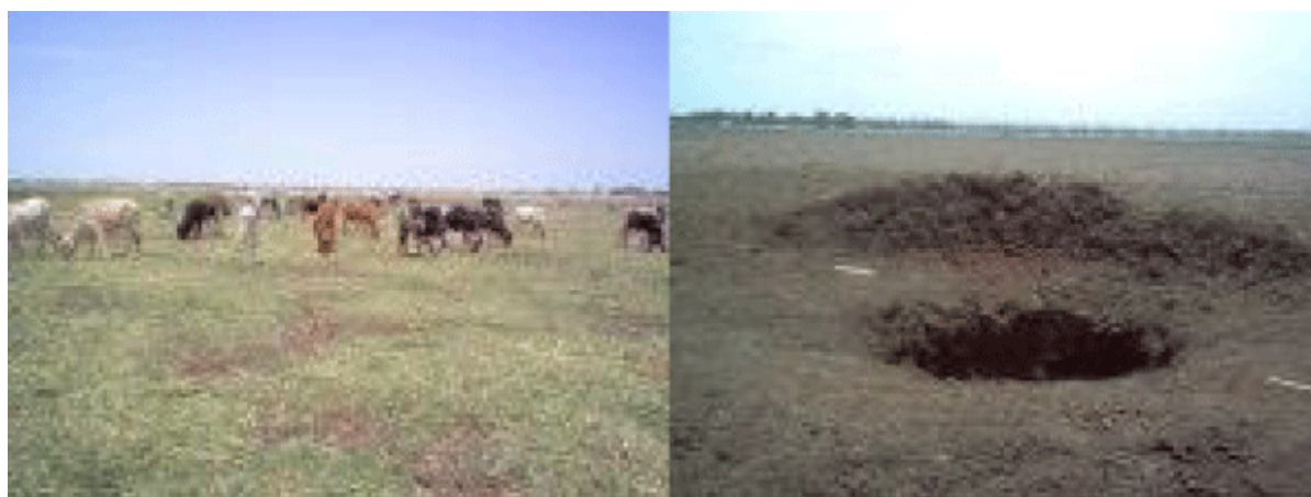
Figure 7: Digging ground water (Well) at the center of Shesher reservoir for their animals after complete dried up of the reservoir.