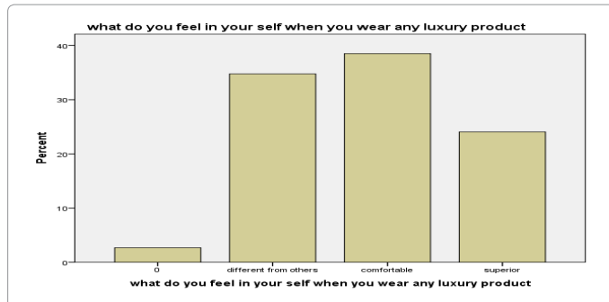
Figure 3: What do you feel in yourself when you wear any luxury product.