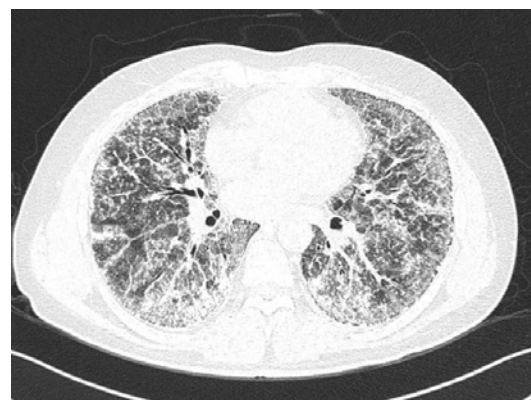
Figure 2: HRCT sections showing ground glass attenuation with inter and intralobular septal thickening with multiple calcified nodules predominantly in lower lobes and in sub-pleural location.

Pulmonary alveolar microlithiasis (PAM) is an uncommon chronic disease characterized by calcification within the alveoli and paucity of symptoms in contrast to the imaging findings [1]. No known cause for the disease had been identified and there appears to be no systemic disorder of calcium metabolism [2]. A rare disease, it has been reported fewer