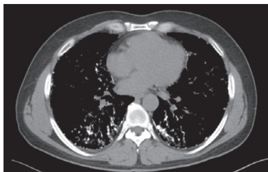
Figure 3: HRCT sections showing ground glass attenuation with inter and intralobular septal thickening with multiple calcified nodules predominantly in lower lobes and in sub-pleural location.