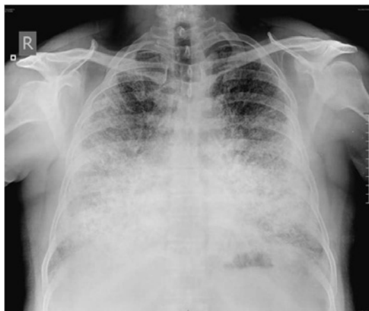
Figure 1: Chest X-ray showing diffuse bilaterally symmetric micronodular calcification (sand storm pattern) involving predominantly the middle and lower lung zones with obliteration of heart borders and the diaphragm.

than 160 times in the literature. Although the cause is unknown, one possibility is an inborn error of metabolism. The high rate of occurrence within families suggests an autosomal recessive hereditary factor [3]. Its pathogenesis has yet to be elucidated. The main characteristic of PAM is widespread laminated calcipherites in the alveolar spaces in the absence of any known disorder of calcium metabolism [1]. The alveolar walls gradually get scarified and slowly progressive physiologic lung impairment becomes apparent [2]. Patient may remain asymptomatic or usually becomes symptomatic in 3 rd or 4 th decade [1]. Though the age range is wide there is some evidence that women are affected more than men in familial cases. There seems to be equal distribution between the sexes in the sporadic cases. In over 50 percent of reported cases, a familial association with sibling has been established [2]. Clinical presentation is usually as a lung disorder with restrictive pattern [1]. The diagnosis of pulmonary alveolar microlithiasis is mainly radiological and is based on 2 factors i.e. characteristic radiological appearance and clinico-radiological association. Chest radiograph is all that is needed for the diagnosis but confirmation with CT scan, scintigraphy,