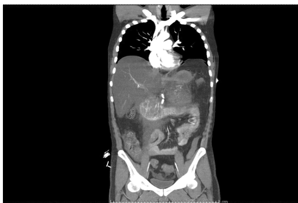
Figure 1: Coronal view of CT abdomen pelvis showing severe pancreatitis.

During the next few hours, clinically there was no improvement in patient's condition despite appropriate and adequate resuscitative measures including but not limited to IV fluids, vasopressors, antibiotics and hemodialysis.