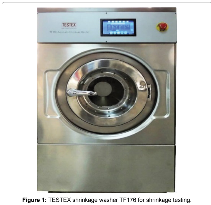
Figure 1: TESTEX shrinkage washer TF176 for shrinkage testing.