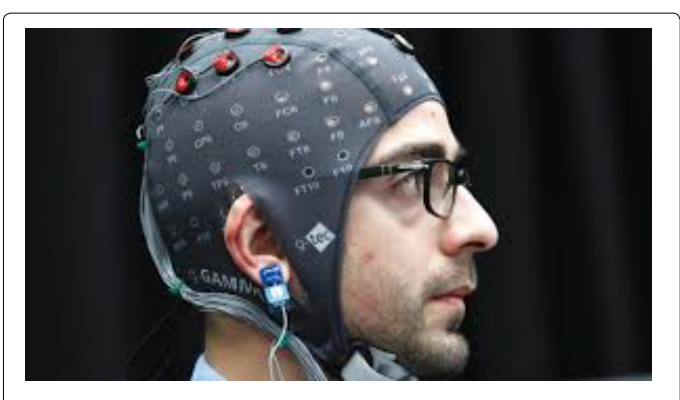
Figure 2: Telepathic telephony model, where thin film optical transceiver (fore head tag) can be used incorporating blue tooth (ear tag) for each user.