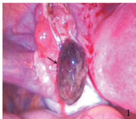
Figure 1: Shows the enlarged fallopian tube.

As shown in Table 1, 6 of these cases occurred after IVF-ET. The fetal reduction of viable pregnancies with local injection of potassium chloride is a common practice for management of HSCP. The intrauterine material cannot be affected by this surgery (Figure 2). This conclusion is limited because the number of cases reported is small, and reports of CSP combined with ectopic pregnancy, such as the third case in our paper, are lacking. Additional studies have shown that fetal reduction can be associated with an increased risk of abdominal pain, pregnancy loss, excessive vaginal bleeding, and prematurity [17-