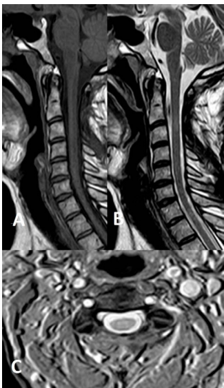
Figure 3: Cervical MR after surgery: complete cyst resection without evidence of recurrence. Sagittal T1 sequence (A). Sagittal T2 sequence (B). Axial T2 sequence (C).