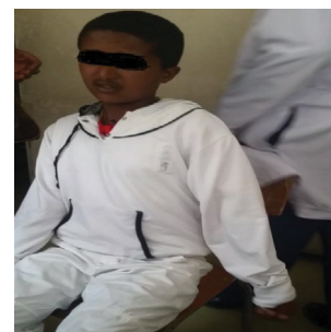
Figure 1: Left upper limb twisted, posturing patient in sitting position.

14-years-old, right handed male patient presented to Tikur Anbessa specialized hospital (TASH), neurology referral clinic complaining of progressive abnormal, involuntary movement of left hemi body of 3