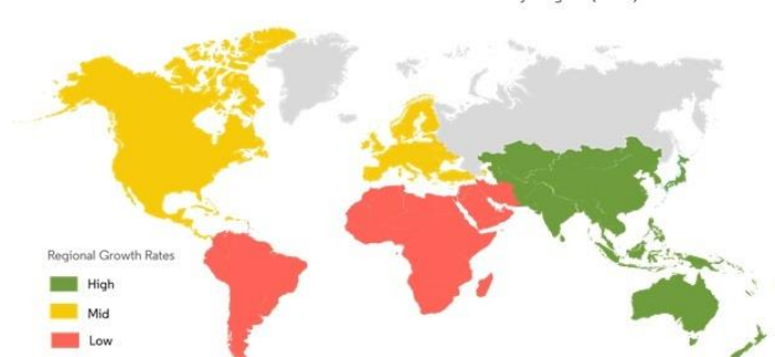
Cardiovascular devices Market - Growth Rate by Region (2018)

The United States dominates the cardiovascular units market, owing to the high incidence of cardiovascular disease, the high adoption rate of minimally invasive procedures, the presence of reimbursements, rising geriatric population, and the excessive demand for non-stop and home-based monitoring.