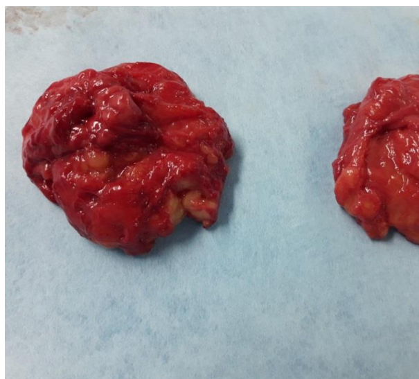
Gland of breast

All pictures show the same patient before and after. In all cases, a bilateral gland excision and a bilateral liposuction were performed.