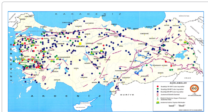
Figure 2: Turkey geothermal resource distribution and application map.

Hydraulic energy potential projects, it is anticipated that Hatay via HPP that produced the amount of electricity rises from 10 MW to 46 MW and Kahramanmaraş rises from 842 MW to 1.402 MW and Osmaniye rises from 774 MW to 844 MW [13].