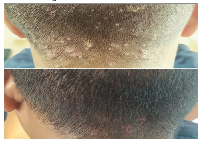
Figure 1: Multiple pin-point and larger pustules on the occipital region of the scalp.

The patient chose motorbike as a primary mode of transportation and used helmet on a daily basis. He used to exercise in the local gymnasium on an irregular basis. On local examination of the lesions over the scalp, multiple papules and pustules were present over the occipital part of the scalp and over the nape of the neck, as shown in Figure 1. Pustules were varying in size, and position; some of the pustules were superficial whereas some were deep within the skin with the follicles presenting an erythematous base. Some of the lesions had healed to form residual scars, but in general, the lesions were recalcitrant in nature. However, no group or tufts of follicles and no active discharge were visible.