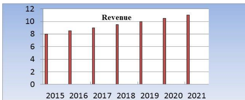
X axis: Years; Y axis: Revenue (USD Billion).