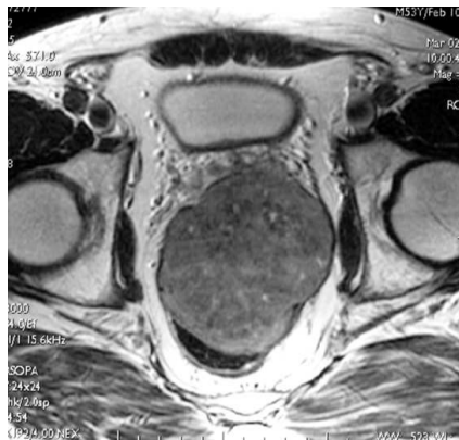
Figure 2: Magnetic resonance imaging (MRI) showing a well demarcated mass in the pelvis adjacent to the anterior rectal wall.