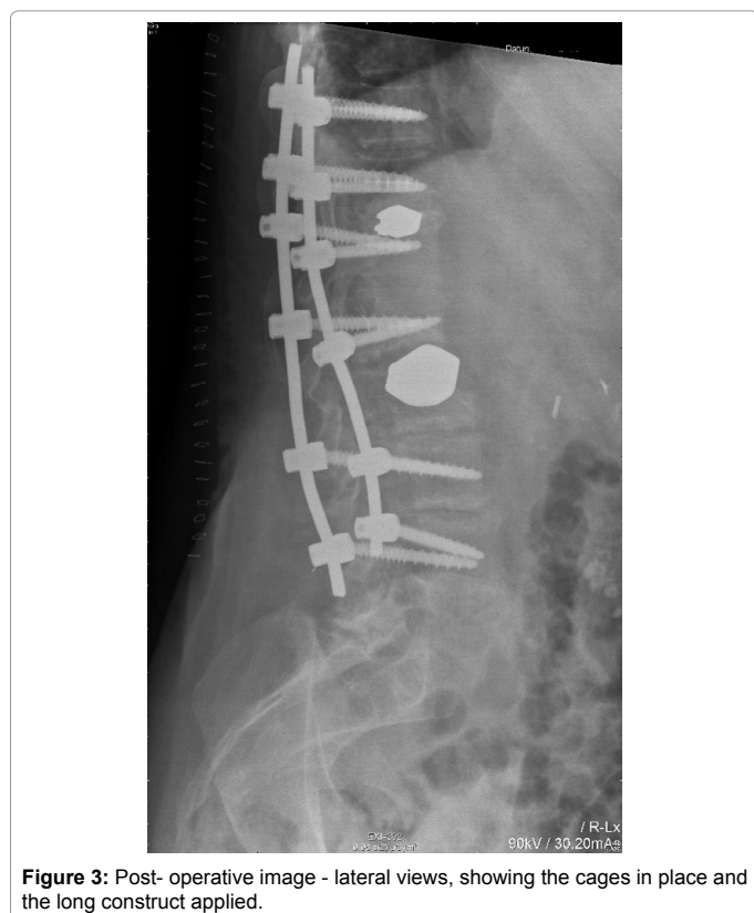
Figure 3: Post-operative image - lateral views, showing the cages in place and the long construct applied.

As fungal infection has been rarely suggested as a cause of vertebral osteomyelitis [22], we conducted an evidence-based literature review (Table 2) [34–46] with the keywords: 'fungal spondylodiscitis', ' Candida