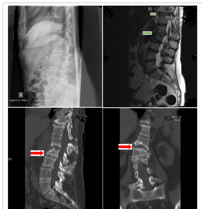
Figure 1: Radiological Images at admission; X-ray: showing disc space narrowing and irregularity. MRI: showing, high signal in disc space (fluid) and adjacent endplates (bone marrow oedema) associated with loss of low signal cortex at endplates CT: destructive or ill-definition of the vertebral endplates can be seen, also bony sclerosis begin to appear.

The empirical antibacterial treatment was stopped due to negative cultures and intravenous fluconazole of 0.6 mg/kg was started. Two weeks later intravenous fluconazole was discontinued and the patient was put on oral fluconazole 400 mg once daily. One month after