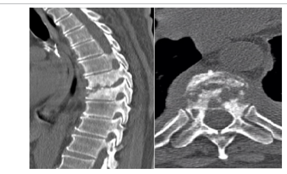
Figure 3: Sagittal and coronal views of the CT scan show the extent of bone fragmentation and sclerosis.