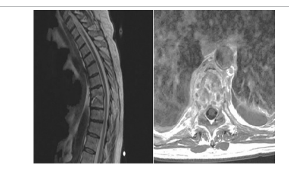
Figure 4: Magnetic resonance imaging of thoracic spine with contrast show involvement of T8, T9 vertebral bodies with associated pre-vertebral soft tissue inflammation.