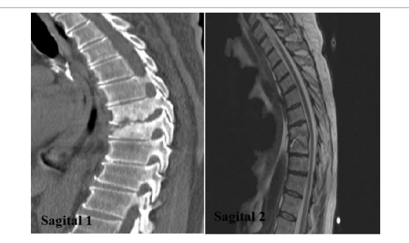
Figure 2: CT and MRI. Sagital view of the spine with fungal infection.