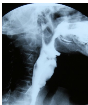
Figure 4b: Swallowing with device in position: easy and functional swallowing.

For evaluating the improvement of swallowing, chewing and speech we used the questions of the University of Washington Quality of Life Questionnaire (UW-QOL v4).