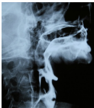
Figure 4a: Swallowing without the device: the bolus does not reach the distal wall of the pharynx; it gets into the esophagus more passively than as a result of an active process, great amount of air is visible in the esophagus.

time X-ray was made. With the denture in place the mechanism of swallowing seemed much more functional and easier, while without the device obvious efforts were visible during bolus formation, since the bolus did not reach the distal wall of the pharynx, which got into the esophagus rather passively than as a result of an active process, and a great amount of air was also swallowed. The radiological findings correlated well with the patient's reports on improved function (Figure 4a and 4b).