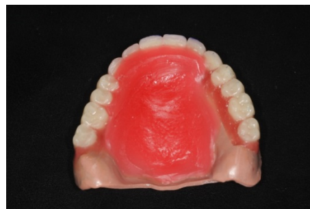
Figure 2b: The preliminary wax pattern of the palate.

During the trial placement procedure functional tests of phonation and swallowing were carried through. First the patient was asked to check if contact in between denture base and tongue could be carried out. Then the patient was asked to pronounce the three basic types of vocal sounds several times, which was followed by the swallowing of a small amount of water. The wax pattern of the palate was modified according to the needs determined by the functional tests. Wax was removed from and added to certain places until good speaking and swallowing functions were achieved. When forming vocal sounds the sufficient air-flow space between the tongue and the surface of the artificial palate could be detected, while checking labial sounds the contact between the lips and the artificial teeth could be controlled. Proper pronunciation of dentoalveolar and alveopalatal sounds was achieved by controlling the contact between the tip of the tongue and the frontal area of the palate of the trial denture, while the quality of palatovelar sounds was affected by the contact of the dorsum of the tongue and the artificial palate. When swallowing and speaking were comfortably and easily carried out by the patient, the functional shaping of the palate was completed. The denture was processed and delivered (Figure 3).