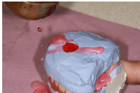
Figure 2a: Changing the irreversible hydrocolloid to wax in the lab.

Following the setting of the irreversible hydrocolloid the trial dentures were transferred to the dental technician and the irreversible hydrocolloid was replaced by wax (Bredent modellierwachs; Bredent, Senden, Germany) (Figure 2a and 2b).