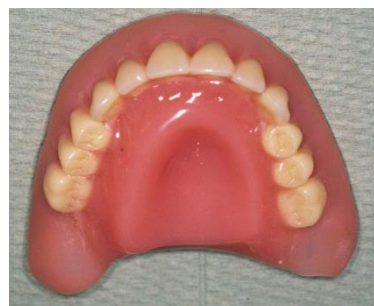
Figure 3: Completed maxillary denture showing palatal augmentation for speech and swallowing aid.

During the trial placement procedure functional tests of phonation and swallowing were carried through. First the patient was asked to check if contact in between denture base and tongue could be carried out. Then the patient was asked to pronounce the three basic types of vocal sounds several times, which was followed by the swallowing of a small amount of water. The wax pattern of the palate was modified according to the needs determined by the functional tests. Wax was removed from and added to certain places until good speaking and swallowing functions were achieved. When forming vocal sounds the sufficient air-flow space between the tongue and the surface of the artificial palate could be detected, while checking labial sounds the contact between the lips and the artificial teeth could be controlled. Proper pronunciation of dentoalveolar and alveopalatal sounds was achieved by controlling the contact between the tip of the tongue and the frontal area of the palate of the trial denture, while the quality of palatovelar sounds was affected by the contact of the dorsum of the tongue and the artificial palate. When swallowing and speaking were comfortably and easily carried out by the patient, the functional shaping of the palate was completed. The denture was processed and delivered (Figure 3).