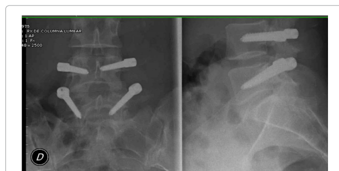
Figure 3: Right L4 screw loosening "Double halo sign" (radiolucent zone surrounded by an outer radiopaque rim of dense bone).

The great variability of the measurement tools found to evaluate the functional outcomes makes impossible to compare the studies. Even those documents which used the same measurement tool, the way to express the result was different. There were authors who expressed improvement by the change of the mean score, while other authors showed the results in percentage of patients who improved. Some documents, assessed functional results only after surgery, without