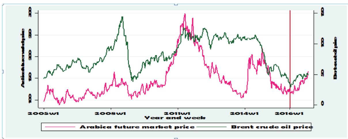
Figure 1. Time series plot for level series, Arabica coffee and crude oil.

As can be seen in Table 4, the best in-sample results are achieved by ARMA (2, 2) for both commodity log return series. Therefore, ARMA (2, 2) is the best (having minimum AIC & BIC) conditional mean equation for both