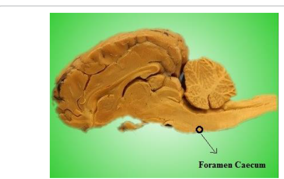
Figure 3: Foramen caecum in medulla oblongata.