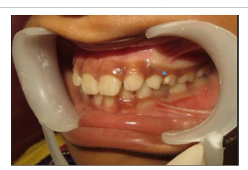
Figure 4: Foramen caecum in the tooth.

Human teeth show morphological variations in size and shape and in both deciduous and permanent dentition. In dental anthropology, the foramen caecum (Figure 4) is a trivial appearance of the protosylid of the tooth. It is related to five non-metric tooth crown traits. According to dental and biological studies, racially mixed populations bare malformed foramen caecum's, resulting in inimitable tooth groove