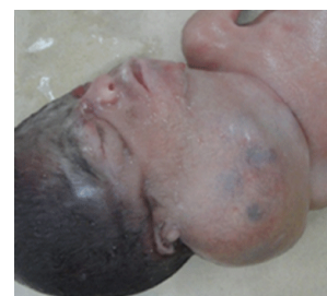
Figure 2: Autopsy of the fetus showing the neck mass which on dissection had blood filled spaces and large feeding vessels from aorta