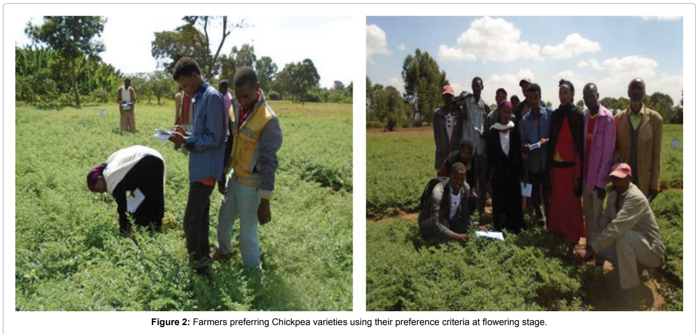
Figure 2: Farmers preferring Chickpea varieties using their preference criteria at flowering stage.