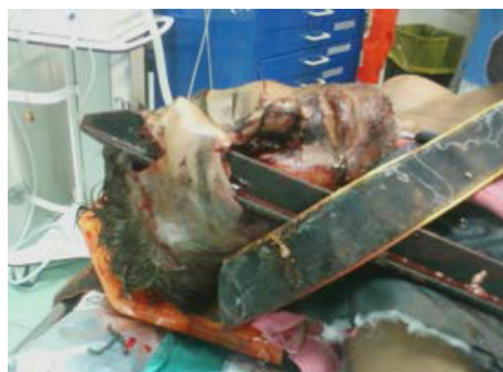
Figure 1: The Patient arrived in ER dept. with the rod passing through frontal area entering in the superior eyelid pushing the eye globe.