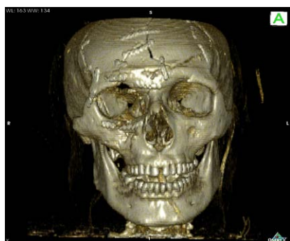
Figure 3: A 3D CT reconstruction in submental view showing the frontal fracture.

and the superior longitudinal sinus was clipped without difficulty. A large-scale duroplasty was performed with a bovine pericardial patch. Fibrin sealant was applied over the repair. The mucosa was removed from the frontal sinus walls as well as from the nasofrontal ducts. The pericranial flap is adapted in order to fit the anterior cranial fossa. The frontal volet was then replaced and secured with plates and screws. It's imperative to relieve any sharp bony edges off the anterior aspect of the bone flap to prevent injury to the vascular pedicle of the pericranial flap. After cranialization, the nasofrontal ducts was obliterated with a piece of temporalis fascia, fibrin glue is applied over the ducts, and the pericranial flap is designed appropriately and folded in order to obliterate the dead space of the sinus. The anterior wall was replaced and secured using plates and screws. All bony impingements on the vascular supply of the flap must be relieved. The bi-temporal flap was then closed in a layered fashion and a pressure dressing is applied and maintained for 48 h [2,3].