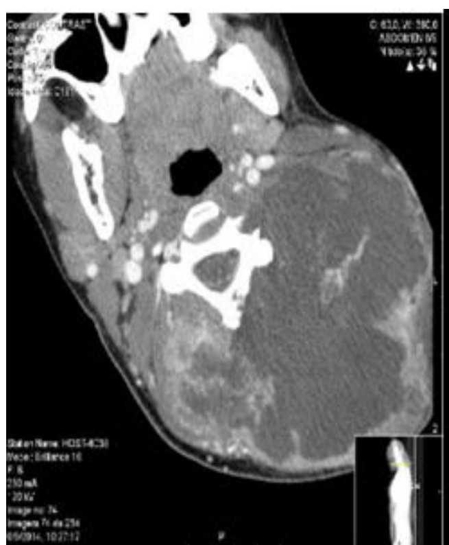
Figure 3: CT scan showing involvement of both superficial and deep cervical fascia.

level of C5-C6, C6-C7 and C7-D1 by the tumor without signs of bone metastasis.