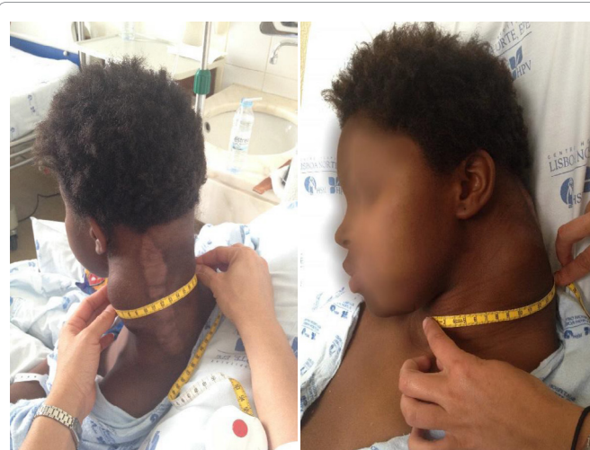
Figures 1 and 2: Indolent swelling at the left cervico-postero-lateral region.

The cervical tumor continued growing alarmingly fast, causing the patient to seek help in the neighbor country Senegal, where the tumor was excised again and histopathological and immunohistochemical examination was performed.