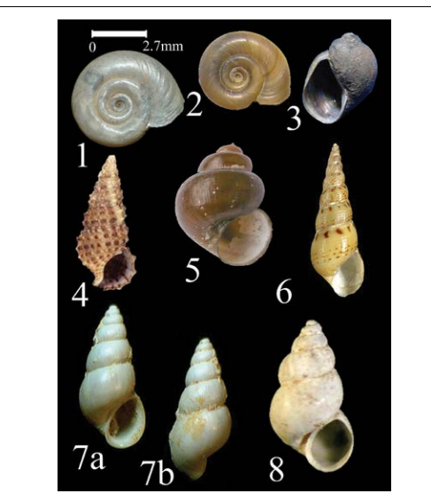
Plate 1: Scale bar for all specimens = 2.7mm. 1) Biomphalaria alexandrina (Ehrenberg, 1831). 2) Biomphalaria glabrata (Say, 1818). 3) Bulinus (Bulinus) truncatus (Audouin, 1827). 4) Cerithium scabridum (Philippi, 1849). 5) Biomphalaria pfeifferi (Krauss, 1848). 6) Viviparous contectus (Millet, 1813). 7) Melanoides maculata Bruguière, 1789. 8) a and b- Hydrobia sp. 9) Hydrobia acuta (Draparnaud, 1805).

Table 5: Chemical parameters of bottom sediments in Manzala Lagoon (autumn season).