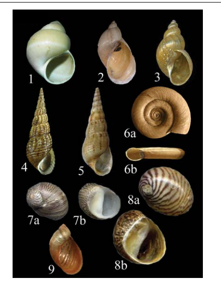
Plate 2: Scale bar for all specimens = 2.7mm. 1) Bellamya unicolor (Olivier, 1804). 2) Lymnaea columella (Say, 1817). 3) Lymnaea (Galba) truncatula (Müller, 1774). 4,5) Melanoides tuberculata (Müller, 1774). 6) a and b - Planorbis planorbis (Linnaeus, 1758). 7) a and b - Theodoxus (Neritaea) niloticus (Reeve, 1856). 8) a and b - Theodoxus (Neritaea) anatolicus (Rècluz, 1841). 9) Succinea (Amphibina) cleopatra (Pallary, 1909).

Plate 1: Scale bar for all specimens = 2.7mm. 1) Biomphalaria alexandrina (Ehrenberg, 1831). 2) Biomphalaria glabrata (Say, 1818). 3) Bulinus (Bulinus) truncatus (Audouin, 1827). 4) Cerithium scabridum (Philippi, 1849). 5) Biomphalaria pfeifferi (Krauss, 1848). 6) Viviparous contectus (Millet, 1813). 7) Melanoides maculata Bruguière, 1789. 8) a and b- Hydrobia sp. 9) Hydrobia acuta (Draparnaud, 1805).