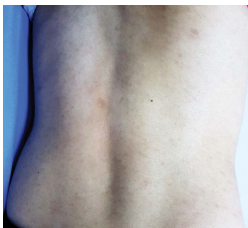
Figure 1: Slate-grey macules on trunk.

Erythema Dyschromicum Perstans (EDP) or Ashy dermatosis is an uncommon acquired and chronic dermatosis, characterized by asymptomatic and progressive hyperpigmented oval, polycyclic macules of various size on the trunk, face and extremities. These brown-grey macules sometimes show erythematous borders [4,5]. Although the etiology of EDP is unclear there are some probable genetic factors related by genes located in the major histocompatibility complex region [6]. There are also some predisposing triggers that have been proposed, such as drugs (antibiotics, benzodiazepines, pesticides), endocrinopathies or HIV and hepatitis like infectious