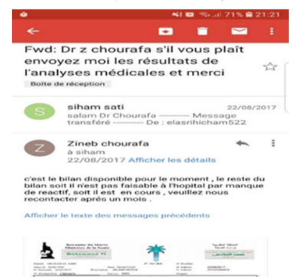
Figure 4. Example of e-mail used to share medical analysis with a patient who lives in Ouarzazat (203 km from Marrakech).

This tool allows a quick and professional easy contact with the attending physician who can answer his patient for free and at any time.