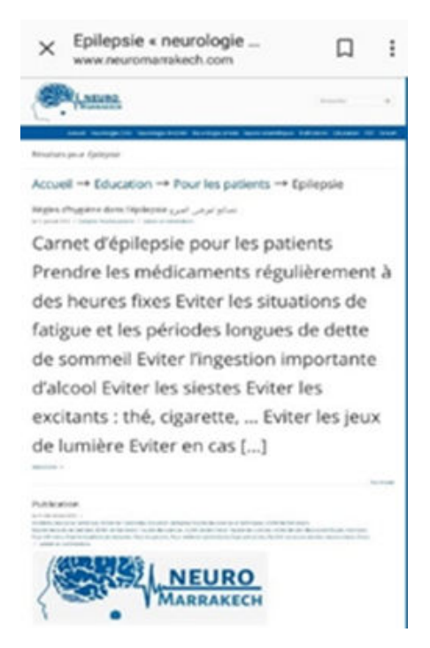
Figure 3. Home page and the epileptic patient portion of our website.

There are several websites for educating the population interested in epilepsy, giving the example of American epilepsy society, that is a coalition of American epilepsy organizations' working together to keep the communities informed on the latest medical breakthroughs, social research, publications, news and policy about epilepsy. (https://www.aesnet.org/) [9].