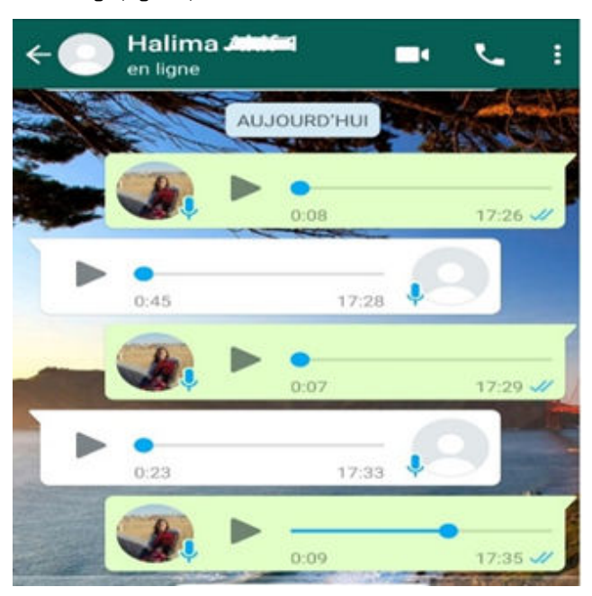
Figure 6. Image of screen capture of a conversation between an illiterate patient and a neurologist using video call and audio recording.

In our current practice, we communicate with these patients by video conferencing if possible or more easily by audio recording, phone call or video call; in extreme cases we try to have contact with educated people in their entourage (Figure 6).