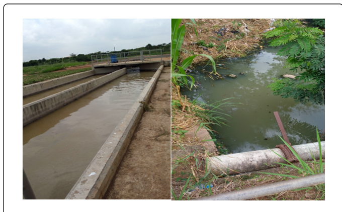
Figure 1. Sites for sample collection in Ghana: left) inlet of sewer lines to sewage processing plant at Legon and right) drainage site at Koforidua in the Eastern region.

In the Eastern region however, only one site was identified at Akosombo in the Asuogyaman district with proper open sewage channel and treatment system that serves a population of about 17,000 inhabitants. This channel receives sewage via 3 smaller and medium-sized sewage channels that drain residential areas. The other identified site was a drainage that runs through many areas and receives waste water from large areas within Koforidua (Figure 1).