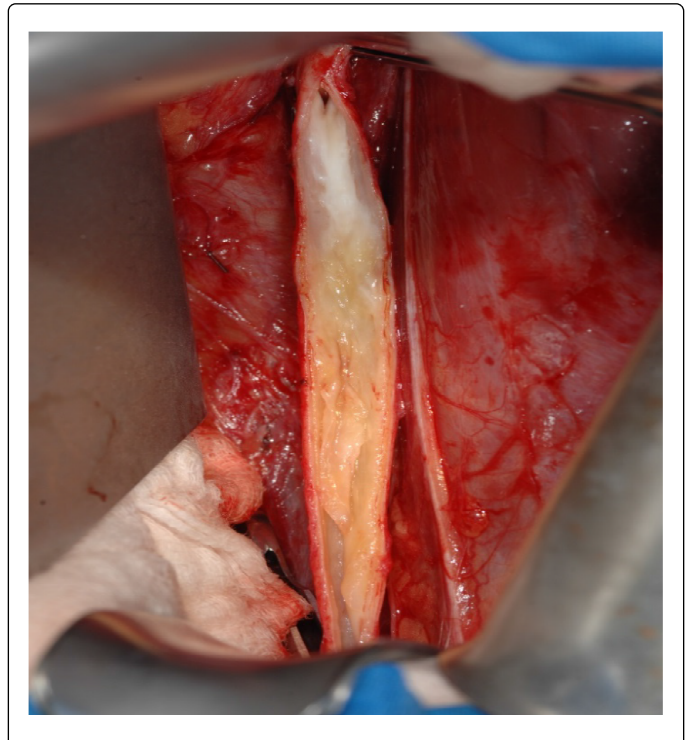
Figure 1: Endarterectomy of the external iliac artery.

A 35-year-old endurance athlete was referred for unexplained claudication-like complaints in his left lower limb. Elsewhere he was treated for functional compartment syndrome and operated for popliteal artery entrapment syndrome which proved unsuccessful. He complained of a painful and swollen left thigh at maximal exercise. Clinical investigation, ankle-to-brachial indices at rest and an additional magnetic resonance angiography were normal. An incremental treadmill test showed pathological ankle-to-brachial pressure measurement, duplex ultrasound imaging confirmed flow limitation and showed lesions of endofibrosis in the left external iliac artery. Surgery consisted of performing an endarterectomy of the external iliac artery with venous patching.