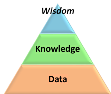
Figure 1: Information Hierarchy [1].

Informatics is the science of information and the blending of people, biomedicine and technology. Individuals who practice informatics are known as informaticians or informaticists [1]. Increasingly healthcare policy and decision makers are demanding evidence to justify investments in health information data [2] Data are symbols or observations reflecting differences in the world. Information is meaningful data or facts from which conclusions can be drawn by assessing the result. Knowledge is information that is justifiably considered to be true. Wisdom is the critical use of knowledge to make intelligent decisions and to work through situations of signal versus noise [3] (Figure 1). Drug information is a specialty area within the realm of clinical pharmacy that has evolved as technology and clinical practice have changed. Drug informatics and drug information can be used interchangeably [3].