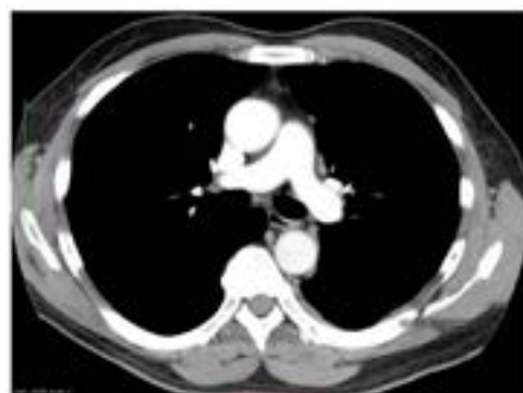
Figure 2: September 2011 (post-cryospray).