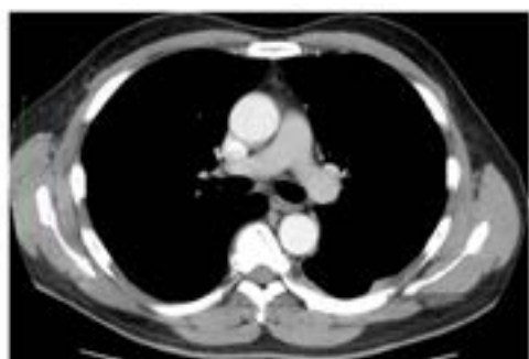
Figure 1: March 2011 (pre-cryospray).

A follow up CT done one month after the cryospray showed decrease in size of the pleural lesions at 3.6 mm compared to 8.0 mm on imaging done 2 months prior. (Figure 1 and 2) At last follow up 5 months after the procedure, the patient's functional status has been stable. His CEA level has increased slightly to approximately 60 ng/mL but the CT remains stable as has his most recent CEA levels (Structure 1).