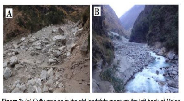
Figure 3: (a) Gully erosion in the old landslide mass on the left bank of Malpa Gad, (b) accumulated sediments along the Kali river banks in the area round Malpa.

• In future recurrence of extreme rainfall events cannot be ruled out and therefore development like temporary camps, tourist camps and realignments of hazardous routes should be needed in safer location.