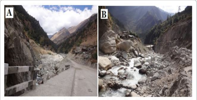
Figure 2: (a) Damaged barricading of bridge together with eroded road at Mangti area due to stream erosion by Simkhola Gad, (b) Accumulated sediments on the right bank of the Simkhola Gad.

by efforts taken to create a vacuum at back side ass per On the same day, flash flood incidence took place at Malpa area in Pithoragarh district. Some of the habitation was situated over the old landslide mass and close to Malpa Gad at bottom of the hill slope. The excessive stream water eroded the old landslide mass on the left bank. The vertical height of the eroded cut is around 8-10 meters and