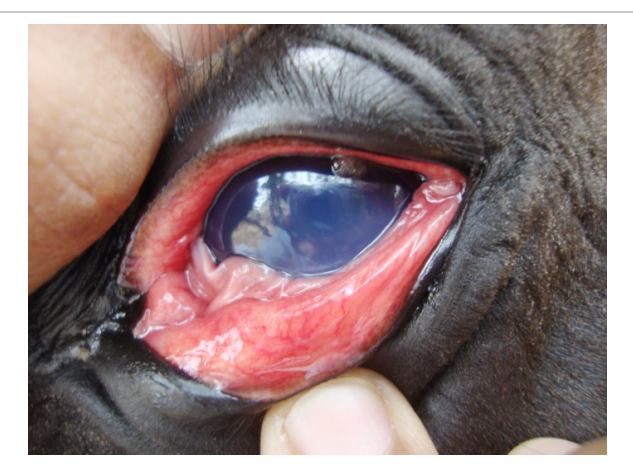
Figure 1: Congested mucus membranes.

with 5% DNS (10 ml/kg body weight) for four days. Three doses of inj ivermectin (at 200 \mu g/kg body weight, SC) were given at one week period interval. By the fourth day, horse was active, but the persistence of irregular arrhythmia was noticed upon auscultation. After two weeks, auscultation of the heart revealed the presence of atrial fibrillation. Based on the presence of the fibrillation it considers as persistence atrial fibrillation and treated with three doses of oral quinidine sulphate (22 mg/kg body weight, at four-hour interval). Improvement in the condition was assessed by the auscultation of heart and it was sinus rhythm. Following therapy horse has uneventful recovered and free from fibrillation after the completion of last dose. Recurrence of the atrial fibrillation was not noticed even after the four months period of observation.