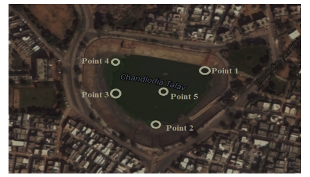
Figure 1: Satellite image of Chandlodia Lake showing the samplings.