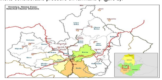
Figure 2. Map of the study area.

The study was employed in the Jimma Zone, located in South Western Ethiopia. Jimma Zone is located between 7°13' to 8°56'N latitude and 35°49 to 38°38'E longitudes. The total population of the study area is 212,277, of which 109,480 (51.57%) is male and 102,797 (48.43%) is female. Agroecological, the Jimma zone is classified into three zones: Highland (35%), midland (47%), and lowland (18%). The largest part of the Jimma zone is midland and the zone is suitable for agricultural yield. The mean yearly rainfall ranges from 1, 200 mm and 2, 500 mm and has a mean annual temperature lies between 20°C and 25°C. The Jimma Zone receives low rains in March while high rains in July. The main production season is July and August during which all major cereal crops are grown. The largest part of this Zone falls within the south Western part of the country. The elevation in the Jimma zone varies from 880 m.a.s.l to 3,340 m.a.s.l. The total area of the Jimma zone is 1.1 million ha. The relatively high population density in the zone coupled with the high proportion of the young population in the rural areas of the zone exerts considerable pressure on farmland (Figure 2).