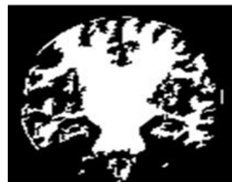
Figure 3: Segmented image.

By proper thresholding gray matter is obtained as shown in Figure 3.