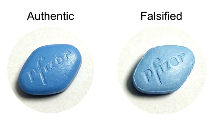
Figure 2. Authentic and falsified Viagra samples.

This article shows miniaturized NIRS in combination with chemometric methods as a new efficient consumer technology for detection of falsified Viagra. We showed 100% accurate classification of thirty-nine (39) Sildenafil-based tablets,