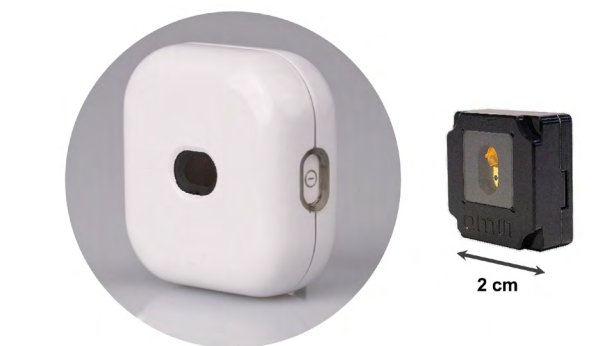
Figure 1. The miniaturized, precise and low-cost Near Infrared Spectroscopy (NIRS) with mobile connectivity via an app and Bluetooth (white model) that incorporates the miniature NIRS (black).

We chose to test Sildenafil-based products (brand name Viagra from Pfizer), because they are among the most often falsified medicines [14]. The falsified sample was sourced in an online pharmacy in EU (Figure 2). Notably, upon delivery, the outer packaging was missing, which contains unique identifiers and anti-counterfeiting marking. This fact would certainly raise attention of regulators and professionals from pharmaceutical industries. However, it would likely be unnoticed by patients. We tested thirty-nine (39) Sildenafil-based tablets including: four (4) lots of authentic 100 mg Viagra, two (2) lots of falsified Viagra, two (2) lots