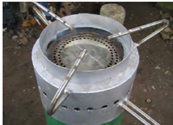
Figure 5: The Gas Burner consists a pot support and a burner with holes of diameter 3-4 mm.

Required heat energy to raise the temperature of the 1 kg water