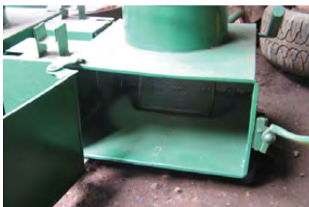
Figure 3: The char chamber of length: width: height is 50 × 50 × 20 cm. Which is the storage device of the end product.