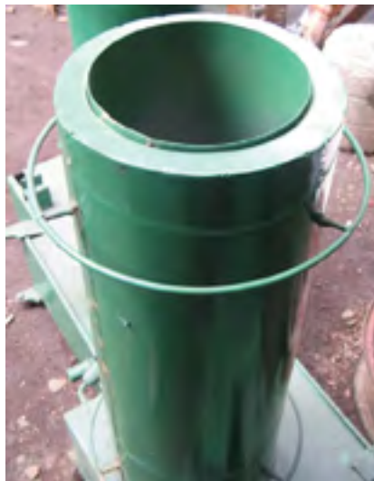
Figure 2: The gasifier reactor of inner diameter 20 cm, outer diameter 23 cm and height 0.6 m were made by Zn coated iron sheets. Use to store the rice husk