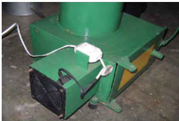
Figure 4: The air blowing system consist a control switch and DC (12 V-3 W) computer cooling fan to blow the air into the gasifier.