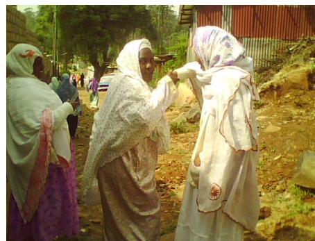
Figure 8: Hand shaking tradition.

Often times such people have earned respect because of their age, social status and education expect others to honor them by kissing their knees. Anywhere and everywhere, many would bow to their knees and kiss. Often times, the respected ones try to avoid people from doing this though they consider it impolite when people fail to kiss their knees at all. Likewise, hand kissing happens after blessing.