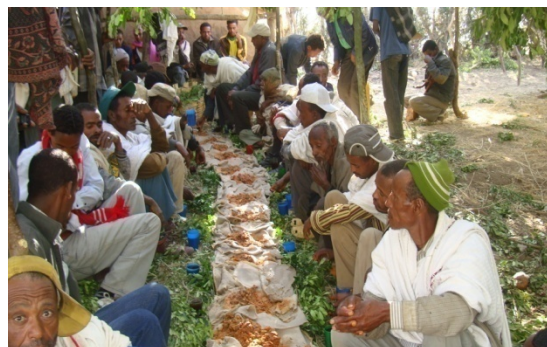
Figure 2: Feast of wedding.

Especially if there was no wedding feast, the in-laws would never get together without a feast, a small or huge one.