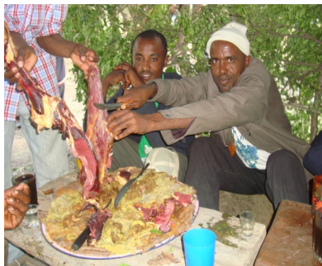
Figure 5: Too much meat served.

the cooked one until they are full. Too much should be left out after everyone gets full. As shown in the next pictures, too much is given and people leave it without finishing it. The norm requires so (Figures 5 and 6).