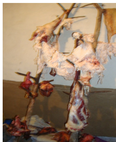
Figure 4: Meat display 2.

They demonstrate the meat in public (Figures 3 and 4). There are also waiters who bring part of the meat to each individual with a knife. The people would cut what they want and take. They eat raw meat and