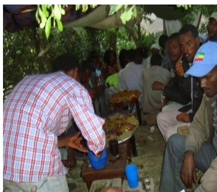
Figure 6: Serving.