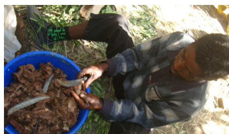
Figure 3: Meat display 1.

In weddings, the hosts present huge investment in meat as shown in Figure 2. What is shown in the following pictures is the demonstration that a too much is available.