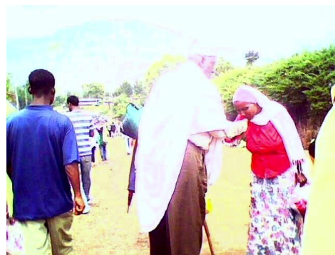
Figure 9: Shaking hand to show respect.

The blessing giver gives his hand to the blessed who then kisses the hand of the blessed. He may tend to kiss the knees but the hand kissing is almost a must after the blessing. This politeness norm is a positive one since people do this out of desire for appreciation (Figures 8 and 9).