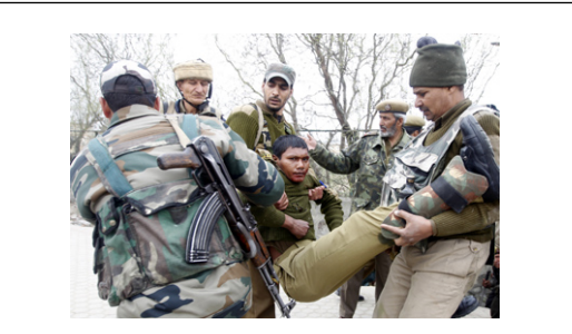
Figure 1: Showing security forces carrying wounded CRPF personnel away from the site of encounter in Bemina on March 14.

The claimed circulation of Greater Kashmir, Rising Kashmir, Kashmir Times and Daily Excelsior are 75,000, 63,000, two million and 2,30499 respectively as per DAVP records (Figure 1).