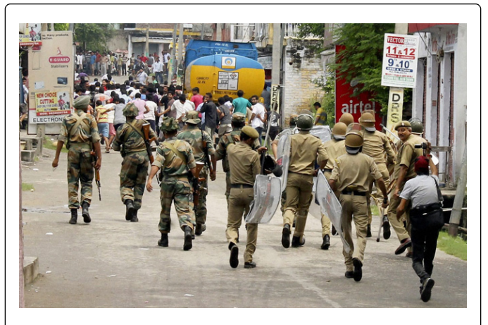
Figure 4: Showing security personnel chase away protesters at a protest during curfew in Kishtwar, Jammu on August 10.

of CRPF in Kashmir, wherein CRPF personnel compelled young boys to lick text from street. But the report was dropped, saying that it will not have good impression of CRPF among readers.